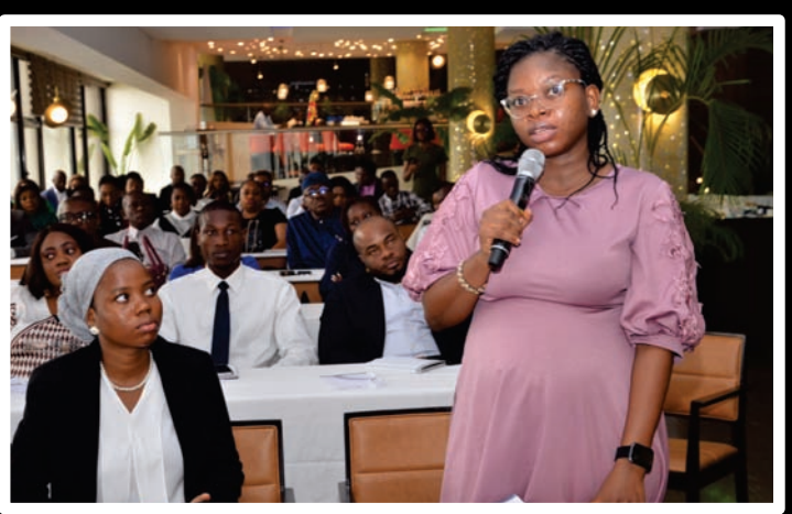
Cross section of participants