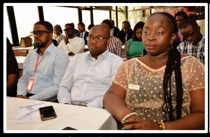
Cross section of participants