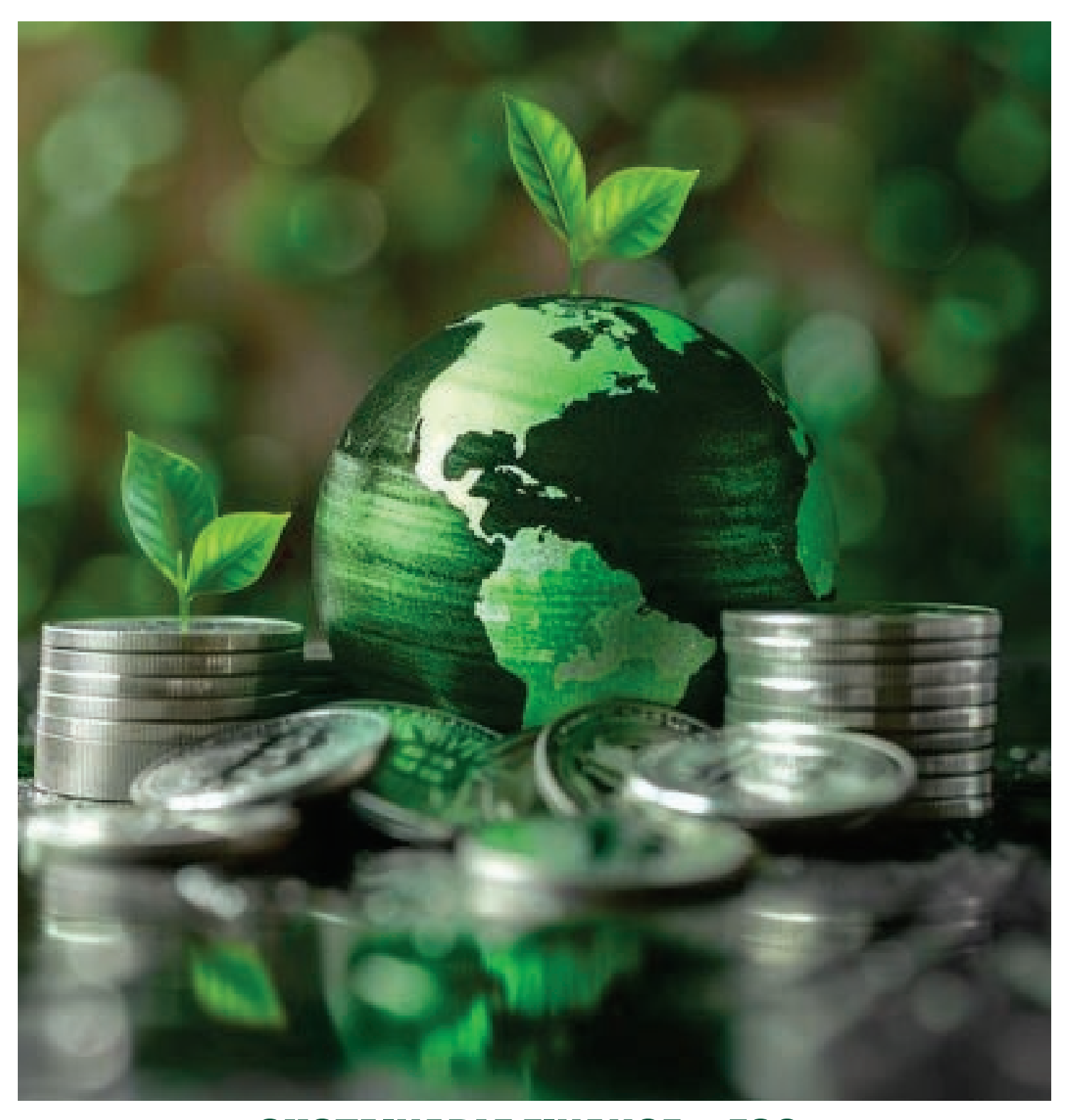
SUSTAINABLE FINANCE & ESG: THE FUTURE OF BUSINESS IN NIGERIA